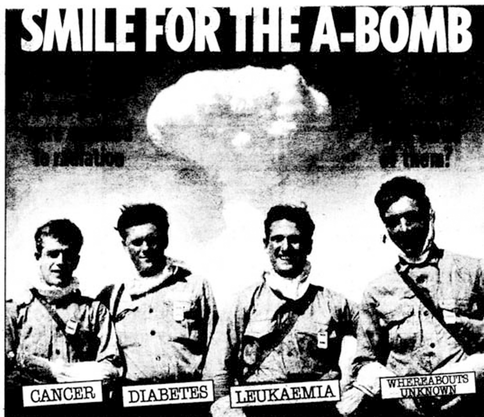
Figure 1 A photograph of naval servicemen witnessing an atomic bomb test while on open deck, wearing dosimeters but no personal shielding.